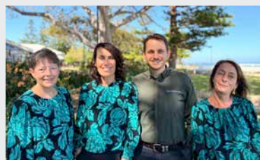
Cape Financial Planning team